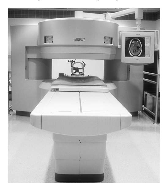
Figure 5. Viewed from the front, an open MRI resembles a bagel more than a donut, allowing the person being scanned more room.

Figure 4. Viewed from the side, a short bore MRI is half the length of a standard MRI, which means your whole body does not have to be inside the scanner, just the area being imaged.