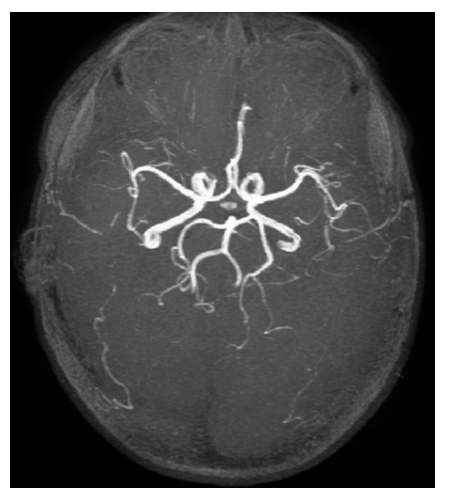
Figure 2. MRA of the brain arteries.