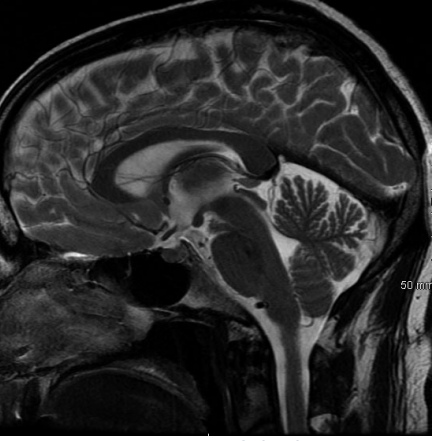
Figure 1. MRI of the brain.

MR angiogram (MRA). MRI can be used to view arteries and veins. Standard MRI can't see fluid that is moving, such as blood in an artery, and this creates "flow voids" that appear as black holes on the image. Contrast dye (gadolinium) injected into the bloodstream helps the computer "see" the arteries and veins. Contrast is also used to view tumors and arteriovenous malformations (AVMs).